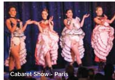
Cabaret Show - Paris